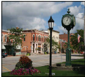
Grow your business in Chardon